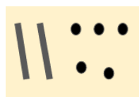
Dots and Sticks